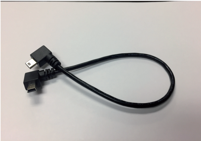
QM23010 Top cable: display to handlebar cable, mini USB 90 degree to mini USB 90 degree.