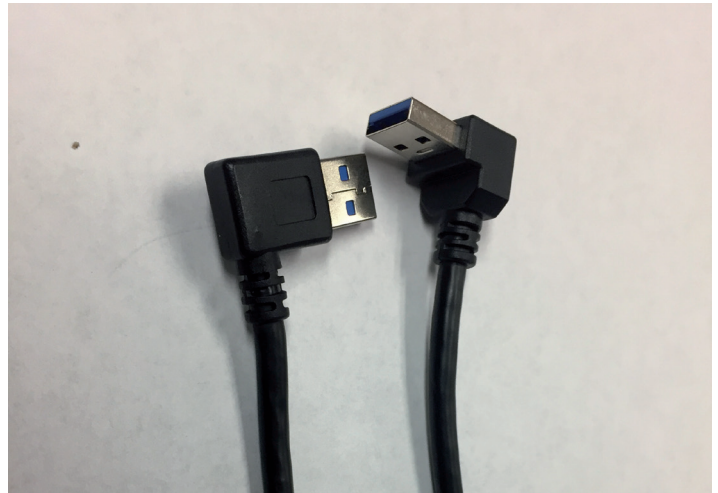
QM23011 bottom cable: handlebar to machine cable, large USB connection, 90 degree to right angle.