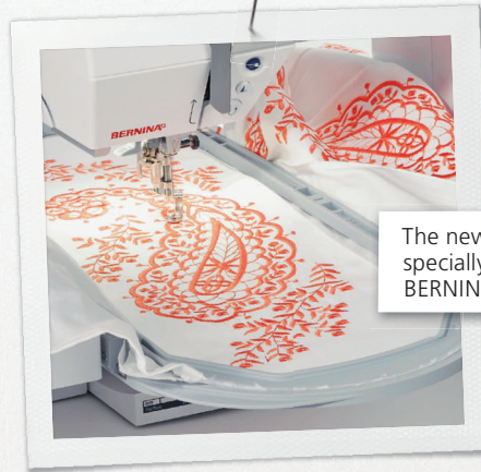
The new Maxi Hoop was specially developed for the BERNINA 7 Series.

Both the B 790 and B 770 QE can embroider, though the B 790 is our embroidery expert offering even more features and options for embroidery lovers. Switch to embroidery mode directly via the touch screen. Embroidery mode lets you easily position, mirror, rotate and resize motifs. Design editing on the B 790 offers a wealth of additional options, letting you create curved lettering effects, alter stitch density, and combine decorative stitches or alphabets with embroidery designs. Complex combinations can even be resequenced according to color, and alternative color options can be reviewed before stitching out. With both models, the finished design can be saved directly on the machine or on a USB stick. What's more, further designs can be imported to the machine via the USB port. The Check function lets you position the design precisely before embroidering. The embroidery module comes as standard with the B 790, and is available as an optional accessory for the B 770 QE.