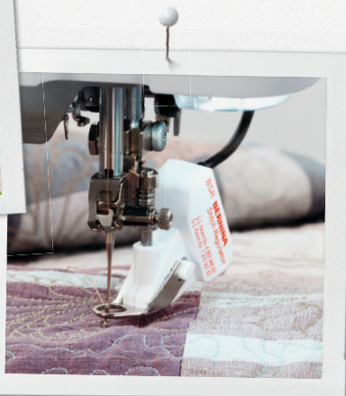
BERNINA Stitch Regulator (BSR) included

A full 13-inch extended frearm , including 10 inches of space to the right of the needle