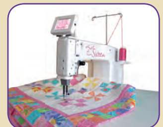
HQ SWEET SIXTEEN® Sit-down