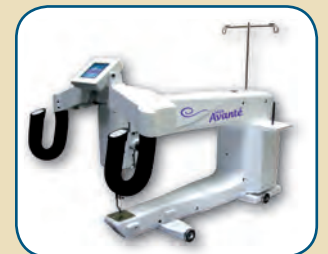
HQ 18 AVANTÉ®