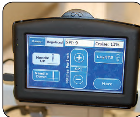
COLOR TOUCH-SCREEN ON FRONT AND BACK HANDLEBARS