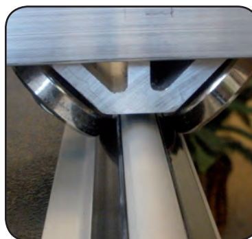
PRECISION-GLIDE ALUMINUM TRACK SYSTEM

SEE YOUR TRAINED HQ REPRESENTATIVE FOR DETAILS.