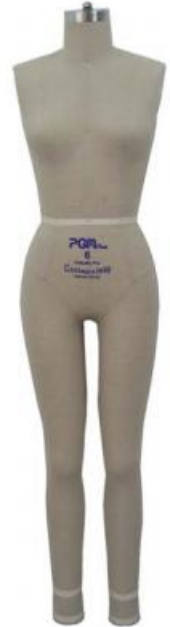
1 qty Dress Form