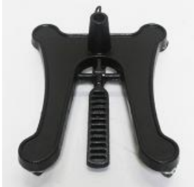
1 qty Base w/ Pedal

Please check the following items in your package