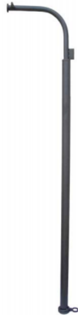
1 qty Outer pole